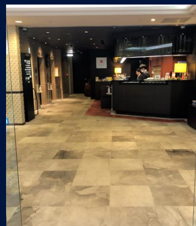
Ginza Capital Hotel Akane lobby